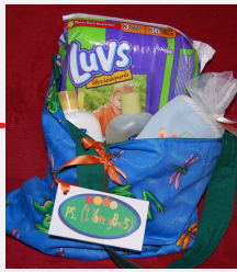
First Care Bag delivered Feb 2010